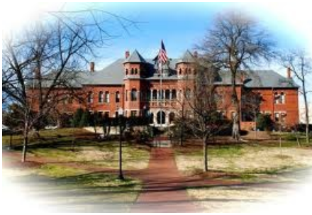
Foust Building on the UNCG Campus

This month's college spotlight is the University of North Carolina at Greensboro. Founded in 1891, UNCG is a public four year university located in the heart of Greensboro. Average costs for the 2008-2009 school year were $4,135 for tuition, $6,188 for room and board, $1,662 for books and supplies, and $2,196 for personal expenses. For that school year, 9,187 students applied, 6,634 students were admitted, and 2,492 students enrolled in classes. UNCG's most popular majors are business and marketing,